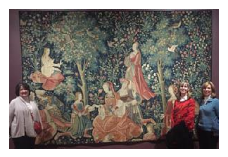
January field trip to Dallas Museum of Art

June (date to be determined) Texas Rangers' Game